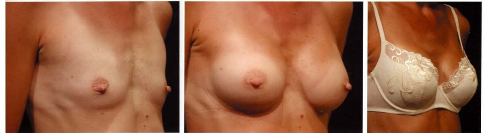
40 year old with small frame, requesting natural looking enhancement.

plasticsurgery pty ltd Suite 701 438 Victoria St Darlinghurst NSW t 02 8382 6738 f 02 8382 6736 w www.plastic-surgery.com.au e plasticsinfo@stvincents.com.au